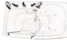
Scaled RC2 (above)